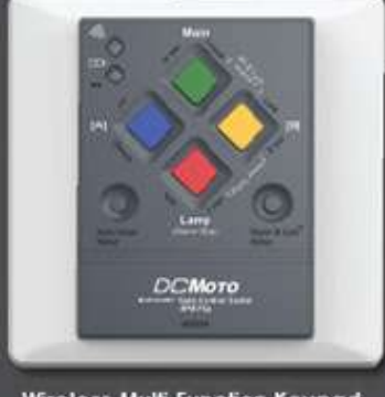
Wireless Multi Function Keypad With Anti-Spy Technology