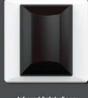
Infrared Safety Beam (Optional)