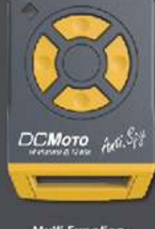
Multi Function Remote Control